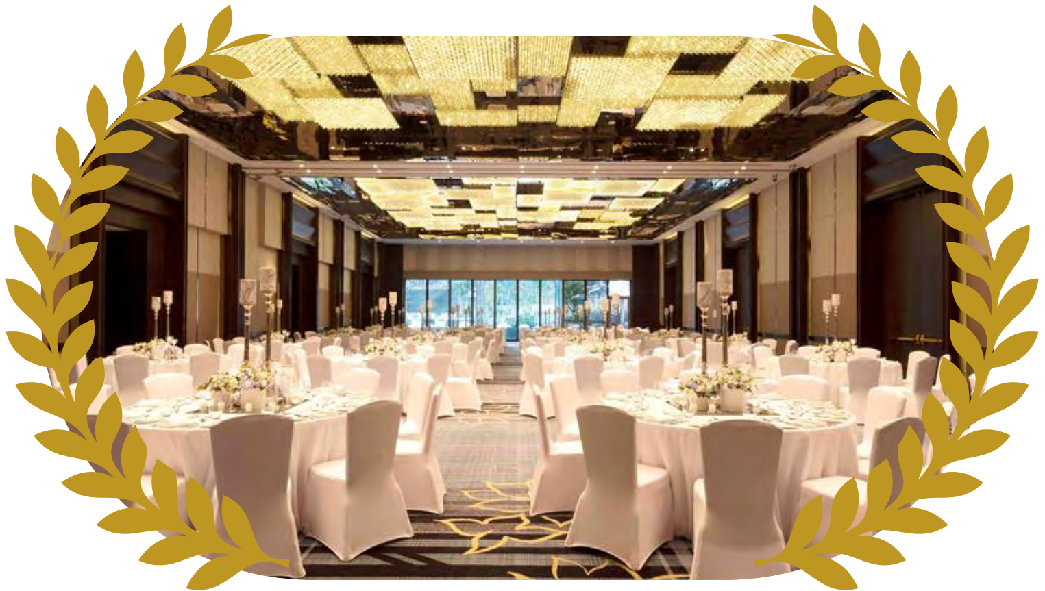
HILTON MANILA BALLROOM