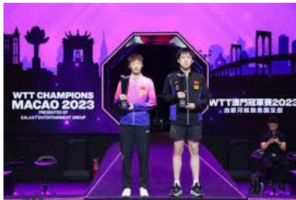
WTT Champions Macao 2023

GEG has been proactively contributing to the Macau SAR Government's policies for development of local sports by supporting and sponsoring the organization of various international sports events in Macau and propelling Macau's positioning as a "World Center of Tourism and Leisure". We are a long-term title-sponsor of two of Macau's four major annual international sports events, and provide equal opportunities for women to participate in competitive sports. GEG was the first integrated resort operator to introduce an all-female dragon boat team in 2009, and we have one of the most diverse sports teams in Macau - from dragon boats to basketball, table tennis, bowling, running, volleyball and more, helping GEG to win over 200 awards over the years.