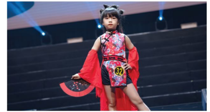
7th Little Models Fashion Show