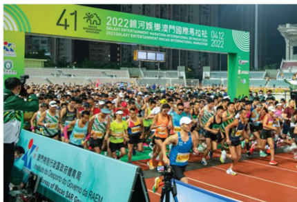
Galaxy Entertainment Macao International Marathon