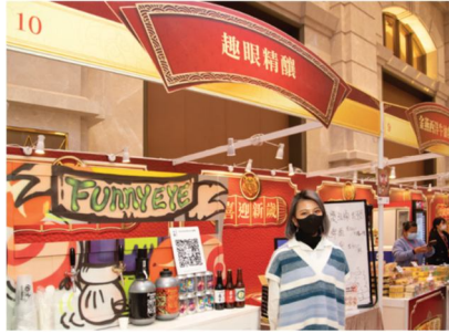
GEG invited homegrown Macau brand, Funny Eye Brewery to join the Chinese New Year Bazaar of Galaxy Macau.