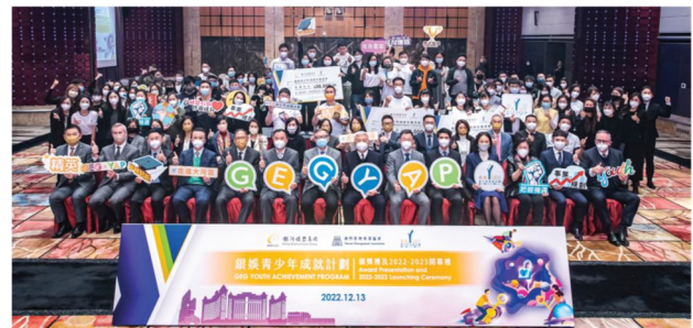
GEG title-sponsored the 11 th GEG Youth Achievement Program. To date, more than 3,000 young people aged 18 to 29 have joined.