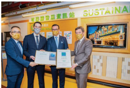
Hotel Okura Macau received the Green Key Certification and EarthCheck Silver Certification.

GEG is strongly committed to protecting the environment and building a greener world for our future generations. In 2022, Hotel Okura Macau received both the Green Key Certification and EarthCheck Silver Certification, becoming the second of GEG's hotel brands to obtain both accreditations, following Galaxy Hotel. Meanwhile, Phase 2 of Galaxy Macau received a "GBA Low Carbon Buildings Top 100 Award" from the GBA Carbon Neutrality Association, making it one of the 100 representative low carbon buildings in the Greater Bay Area. These accolades from reputable international bodies reaffirm GEG's efforts in environmental protection and sustainable development.