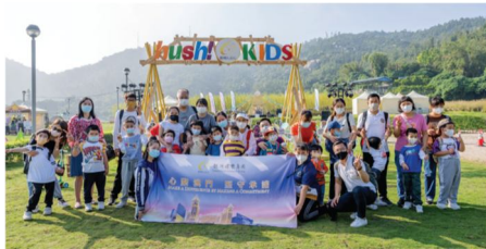
“GEG hush! Kids”