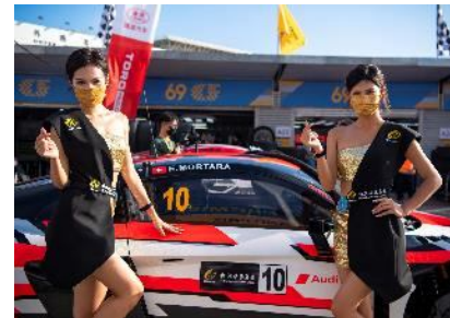
69th Macau Grand Prix