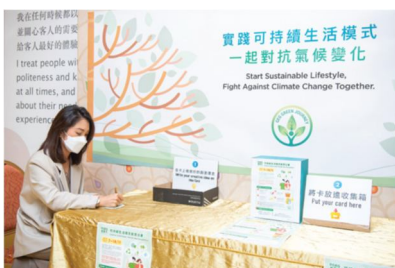
GEG organized "Creative Sustainable Lifestyle Idea Competition" as part of the 2022 GEG Energy & Environmental Conservation Month activities.