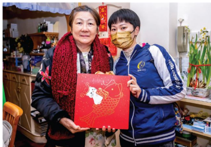
GEG volunteers paid elderly home visits and delivered festive gifts.

GEG stays true to our corporate citizenship pledge of “Community at Heart, Empathy in Action” by offering our dedicated support to different community groups. In 2011, GEG established the GEG Volunteer Team for our team members to engage in volunteer work and to give back to society. Over the years, the GEG Volunteer Team has organized more than 520 community activities, contributed over 362,000 community engagement hours, and reached out to close to 183,000 beneficiaries. In 2022, GEG received the “Charitable Community Award” at the prestigious International Gaming Awards (“IGA”) Ceremony in London for the 2 nd consecutive year.