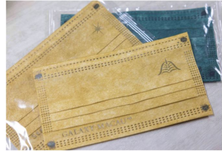
GEG supported "Made in Macau" brands by purchasing "Macau 853" face masks from Macaufacture Medical Supplies Ltd since 2021.