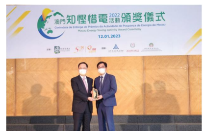
Broadway Macau received the Excellence Award of Hotel Group B and the Continuous Energy Saving Award of Hotel Group of the "Macao Energy Saving Activity 2022".