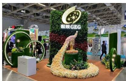
GEG joined the "Macao International Environmental Co-operation Forum & Exhibition 2023" and received a Green Booth award for our environmental efforts.