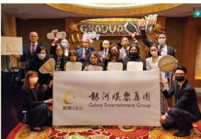
GEG held a graduation ceremony for 75 team members who completed the Advanced Diploma in Gaming Management under GEG’s sponsorship.