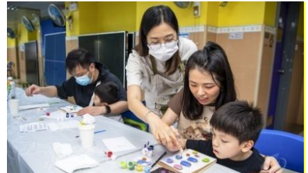
Valuing team members’ psychological health, GEG and Youth Volunteers Association of Macao co-organized the “Responsible Gaming Parent-child Stone Painting Workshop”.