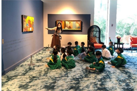
Educational Program specially curated for local schools were offered at GalaxyArt.

One Base", GEG offers numerous opportunities for the public to experience film, music, art exhibitions and cultural preservation.