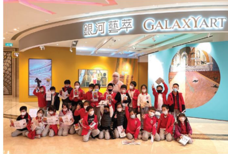
Docent-led tours for local school students