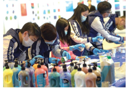
GEG volunteers joined a Fluid Painting Workshop in celebration of "2022 World Autism Awareness Day".