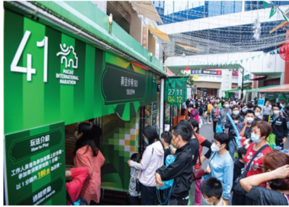
GEG invited SMEs and local businesses to join the 2022 Galaxy Entertainment Macao International Marathon Carnival.