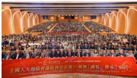
GEG held “Two Sessions” Sharing at Galaxy International Convention Center Auditorium for 650 executives as part of the GEG National Education Series.

With regard to our team members, GEG is strongly committed to helping our team members attain work-life balance. To foster teamwork and companionship, we empower our GEG Staff Social Club and Team Member Services to organize different activities for them and their family and friends to enjoy. As well, our talent development strategy focuses on developing team members so that they are versatile to support our diversified business and can support Macau’s expansive economy.