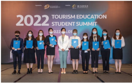
GEG joined the Macao Institute for Tourism in hosting the “7th Tourism Education Student Summit.”