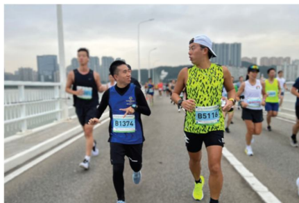
Marathon "Run with a Partner" Training Program