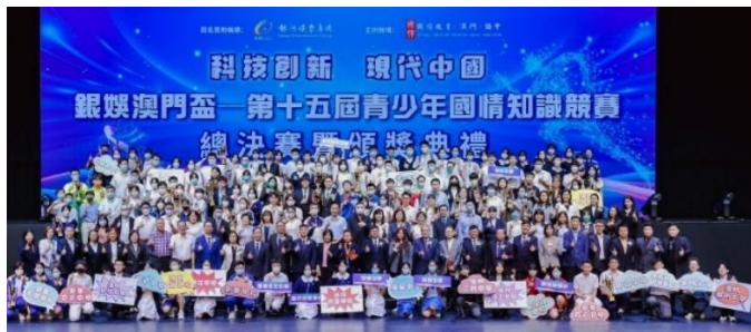
15 th GEG Macau Cup – Youth National Education Competition. Since 2009, the competition has attracted nearly 120,000 students.

Believing that “education engenders a strong country”, over the years, GEG has promoted youth development through funding training programs, offering internships, hosting learning visits, and providing career coaching and exchange opportunities for young people.