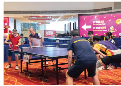
GEG Inclusive Table Tennis Fun Day