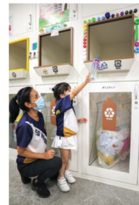
GEG volunteers and their children visited the Recycle FUN station in Mong Ha, which was organized by DSPA and operated by Green Future Macau.