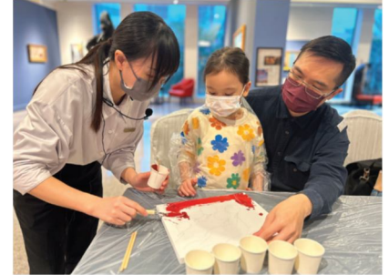
Free art workshops for parent and children