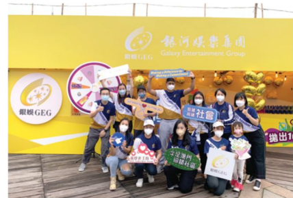
GEG volunteers joined the 53 rd Caritas Bazaar.