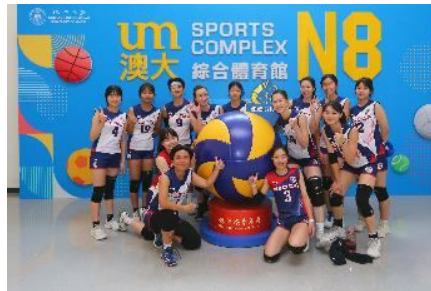
GEG Presents: 1st Volleyball Super Bowl