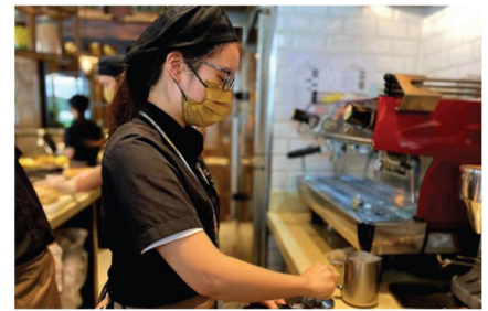
StarWorld Hotel organized barista trainings for students from University of Macau’s Lui Che Woo College.

With regard to our team members, GEG is strongly committed to helping our team members attain work-life balance. To foster teamwork and companionship, we empower our GEG Staff Social Club and Team Member Services to organize different activities for them and their family and friends to enjoy. As well, our talent development strategy focuses on developing team members so that they are versatile to support our diversified business and can support Macau’s expansive economy.