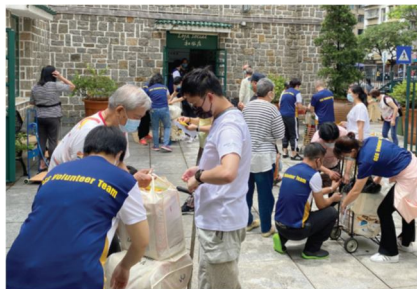
GEG volunteers and YAP members handed out food hampers to underprivileged families.