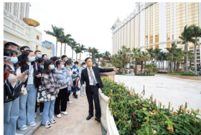
GEG provided property tour for 50 teachers and students of the Macau Institute of Management and the Wuyi University to understand our sustainability measures.