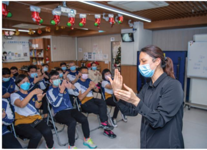
GEG volunteers attended a sign-language workshop.