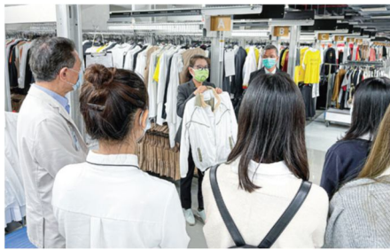
Over 400 students from four local universities participated in the lectures and property tours organized by GEG in 2022.