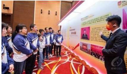
Team members visited the National Security Education Exhibition for the 5 th consecutive year as part of the GEG National Education Series.