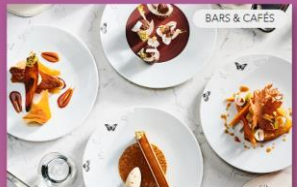
BARS & CAFÉS