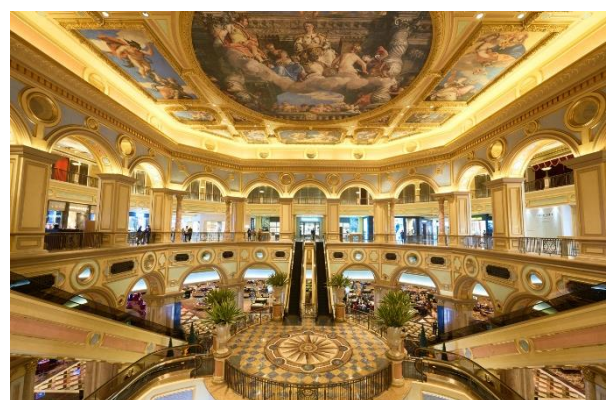
The Great Hall