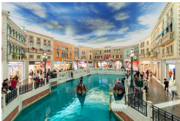
San Luca Canal