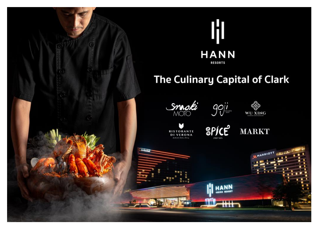
WORLD CLASS ENTERTAINMENT AT HANN CASINO

Read more here: Hann Resorts: Culinary Capital of Clark